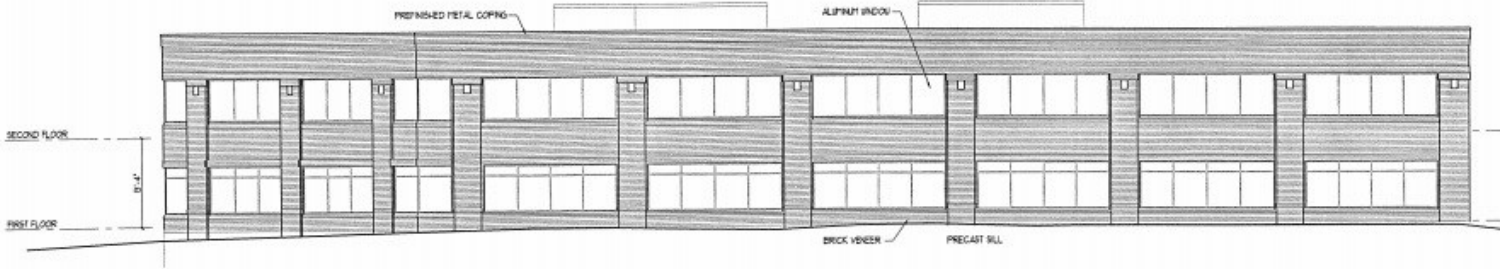
1 EAST ELEVATION A1.0 SCALE: 1/8" = 1'-0"